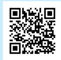
This way for staff

Tell us how you feel your home care journey has gone. Whether you are a customer or an employee, we want to know what you think.