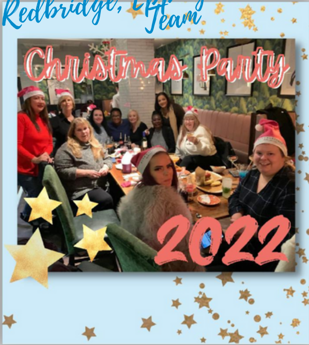
Redbridge, Epping & Harlow Team