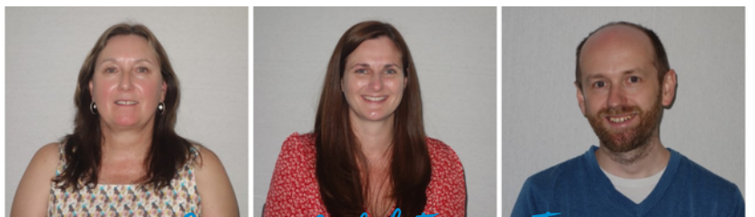
Our wonderful Finance Team