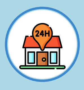
Remain independent living in your in own home

Home Care offers the necessary care and support needed for someone to remain safe and independent in their own home. It is different to residential care as it allows the person receiving care to stay in their own home whilst receiving the care and support they need, offering higher levels of person centred care