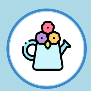
Continued enjoyment of a garden and gardening