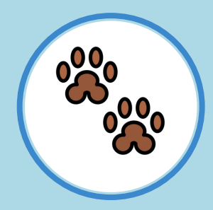
Avoid separation from much loved pets