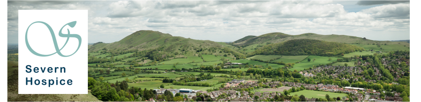
Landscape across the Severn Stride