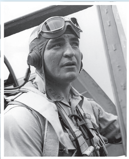
A typical RAF pilot from around the 1950s