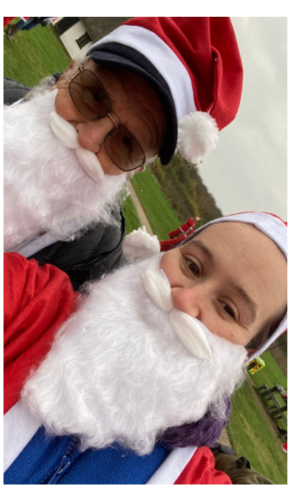
Santa Run 2022 -fundraising for Havens Hospice..